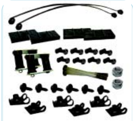
• Mono-Leaf Kit... '67-'69 K00158 ..... $309.95 Kit