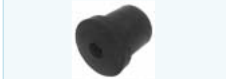
• Bushing, Rear... '67-'81 Replacement rear bushing used for rear shackles. 8 required per car K00044 ..... $3.49 Each • Bushing, Rear GM... '70-'81 K00044-70 ..... $7.80 Each