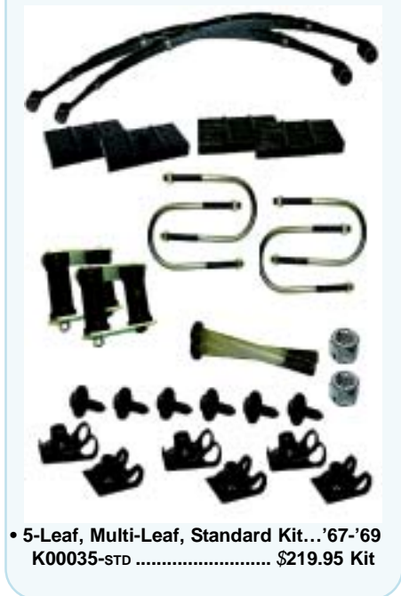
• 5-Leaf, Multi-Leaf, Standard Kit... '67-'69 K00035-STD ..... $219.95 Kit