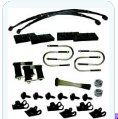
• Multi-Leaf, Heavy Duty Kit... '71-'81 K00035-HVDTY71 ..... $234.95 Kit