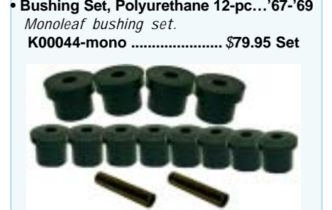
• Bushing Set, Polyurethane 12-pc... '67-'69 Monoleaf bushing set. K00044-mono ..... $79.95 Set