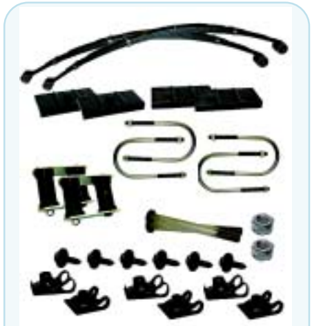
• Multi-Leaf, Standard Kit... '70 only K00034-STD70 ..... $219.95 Kit