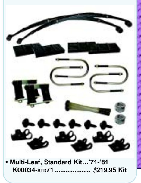
• Multi-Leaf, Standard Kit... '71-'81 K00034-STD71 ..... $219.95 Kit