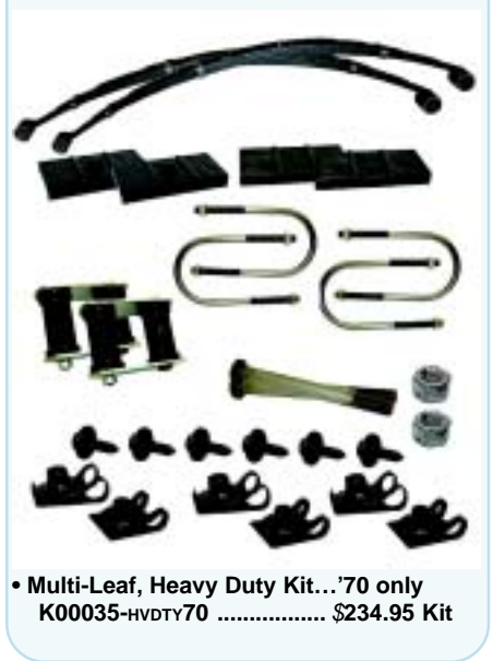
• Multi-Leaf, Heavy Duty Kit... '70 only K00035-HVDTY70 ..... $234.95 Kit