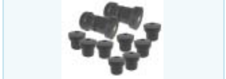
• Bushing Set, Polyurethane 10-pc... '70-'81 Multileaf bushing set. K00044-kit7 ..... $79.95 Set